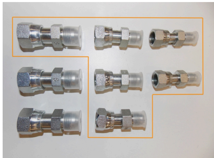
Figure 3: Closed Center adapters

Closed Center applications (200-0766-02) will use 6 of the 8 adapters as show below in Figure 3. Outlined in Orange are (qty. 1) -8 FORF to -8 MJIC fitting, (qty. 3) -6 FORF to -6 MJIC fittings and (qty. 2) -4 FORF to -4 MJIC fittings.